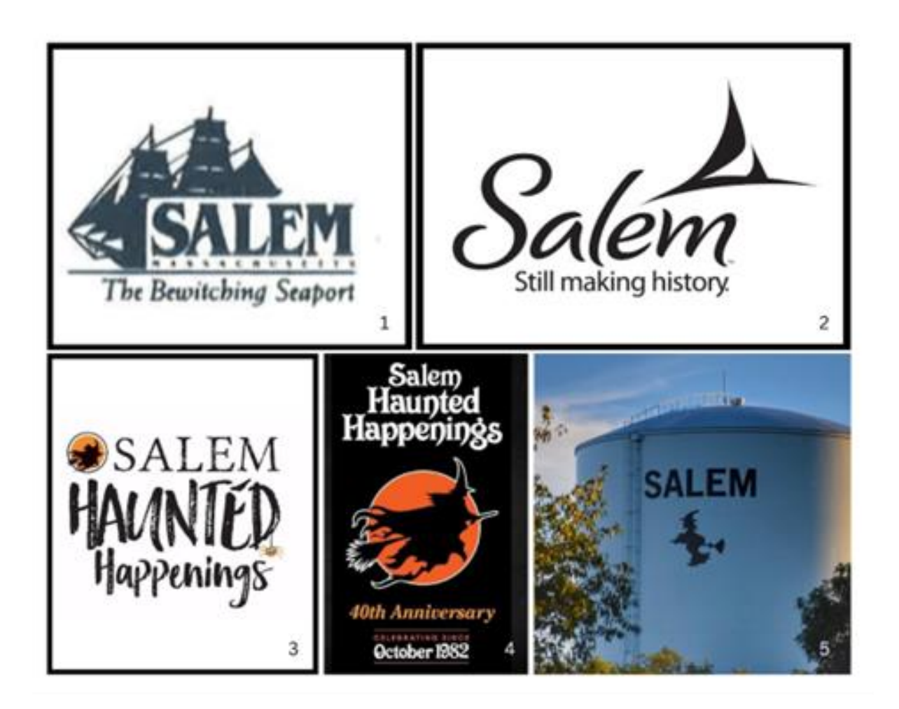
Figure 2: Semiotics of the supernatural in Salem, MA, USA

The omnipotence of the Salem Witch has been commodified through the manipulation of signs and symbols. The Salem Witch is now a kitsch and mass produced, almost juvenile and naïve, symbol of the underworld. In turn, semiotics of the Salem Witch and its associated destination branding renders the complex and contested nature of the original Witch Trials. Indeed, complexity of the difficult heritage that the Witch Trials provokes is manipulated and a conspicuous commodity culture prevails. Consequently, the Salem Witch offers the city an identity that promises economic prosperity in a highly competitive global visitor economy. Similarly, the Salem Witch is also an emotional marker of cultural trauma constructed for consumer recognition and (in)authentic association (Crouch 2011). The purposeful use of witchcraft iconography by destination marketing authorities ensure that urban supernatural semiotics encourages dominant discourses about difficult heritage. Thus, witch imagery conjures culturally significant thoughts and emotions to Salem's portrayed identity and social milieu, shaping both the city's semiotic landscape and its interpretation of its esoteric past. Yet,